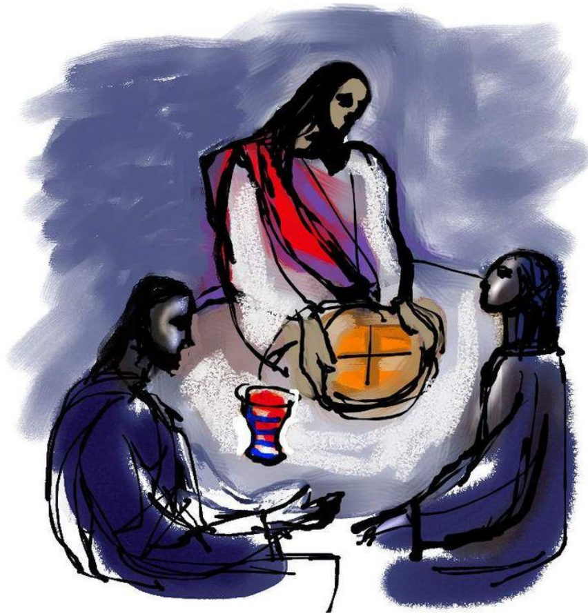
The Road to Emmaus