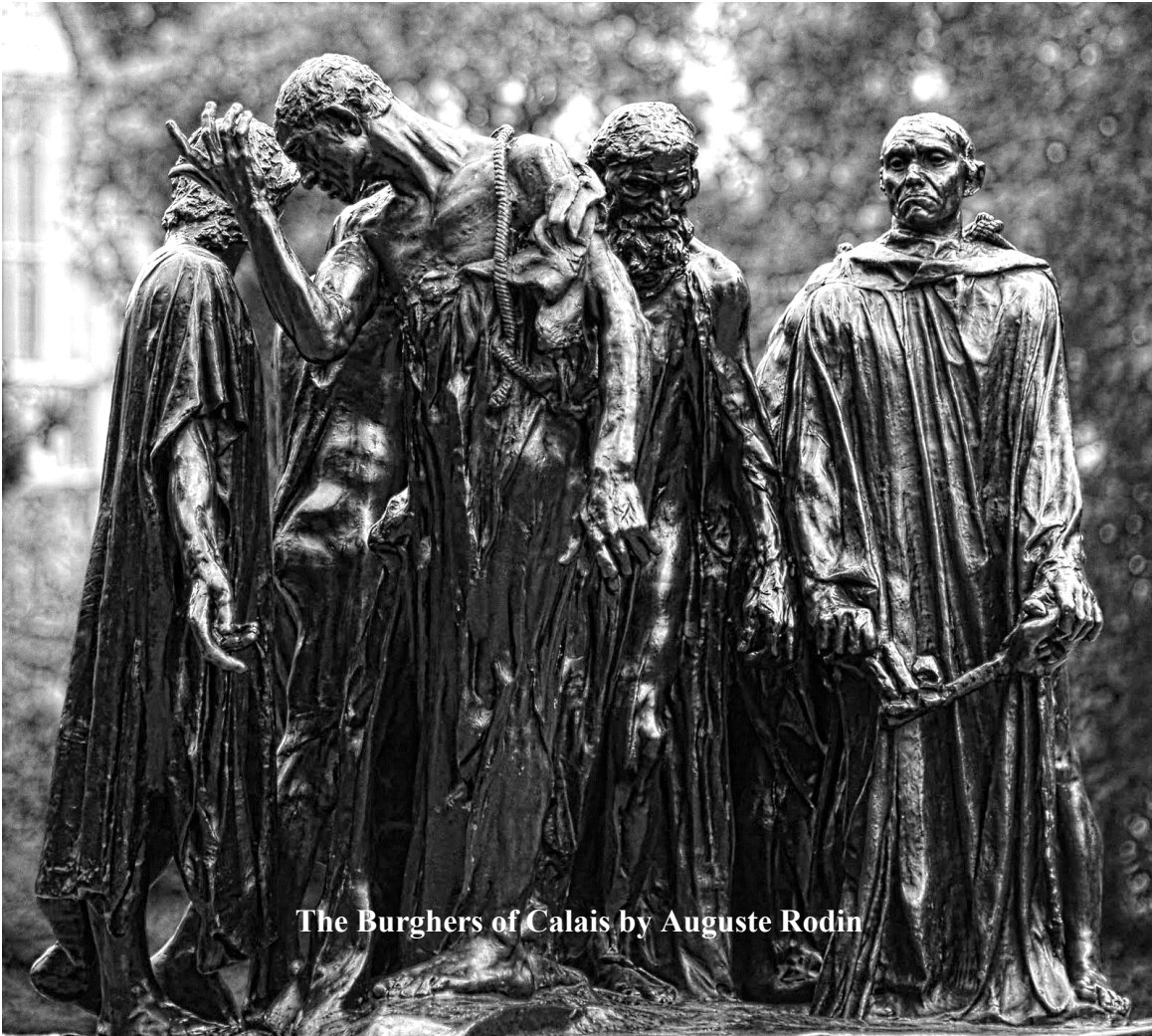
The Burghers of Calais by Auguste Rodin