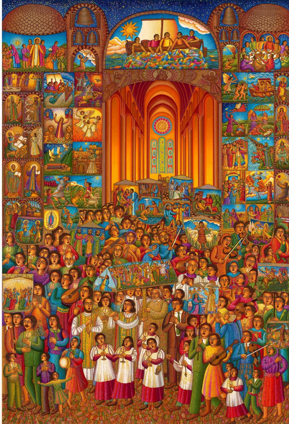
The Procession.