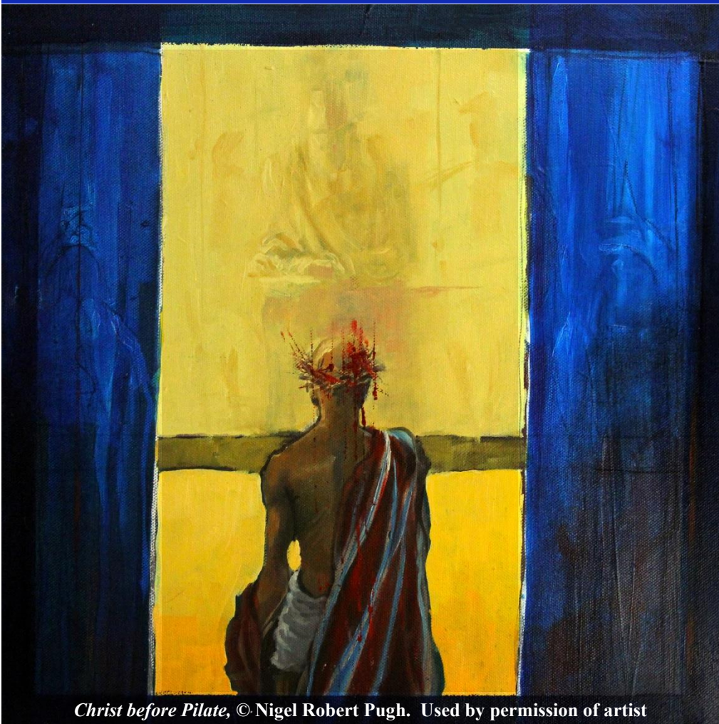
Christ before Pilate, © Nigel Robert Pugh. Used by permission of artist