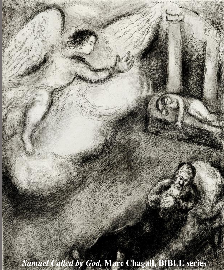
Samuel Called by God, Marc Chagall, BIBLE series