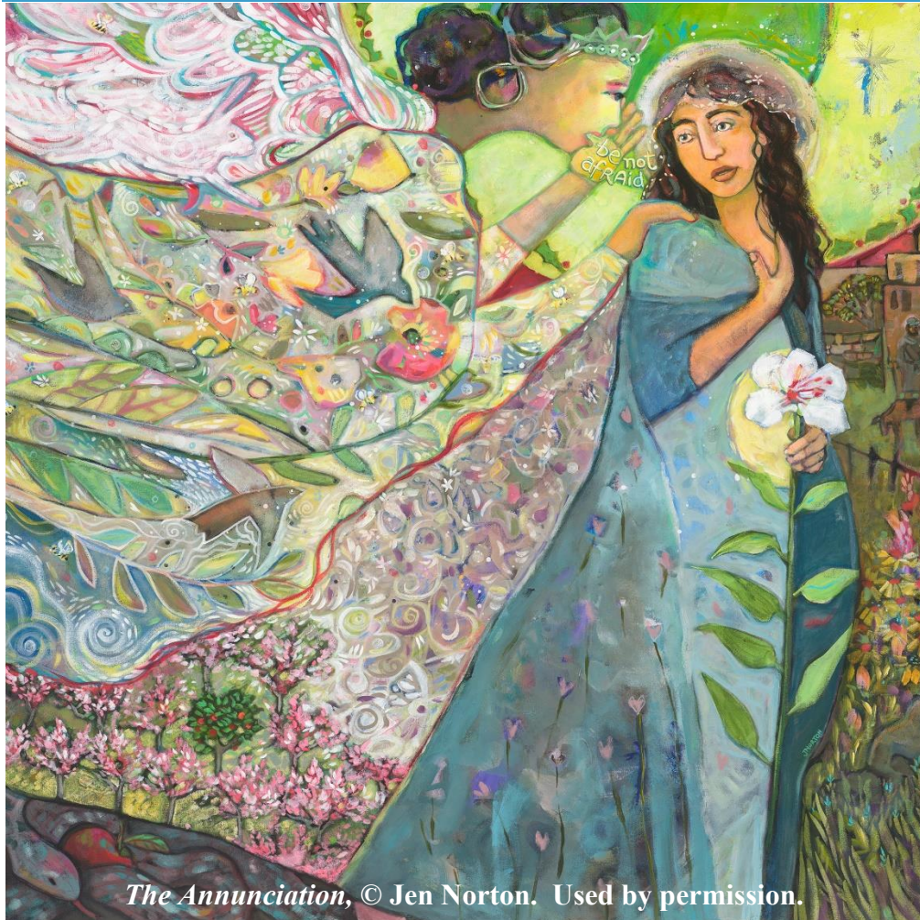
The Annunciation , © Jen Norton. Used by permission.