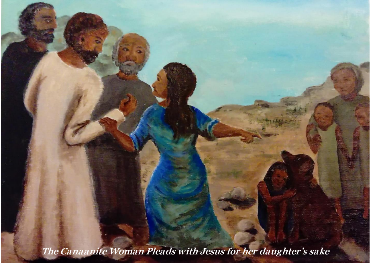
The Canaanite Woman Pleads with Jesus for her daughter's sake