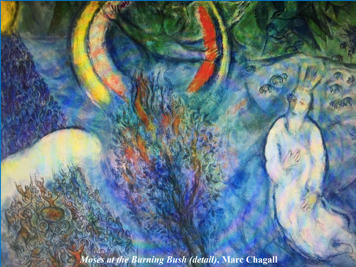
Moses at the Burning Bush (detail), Marc Chagall