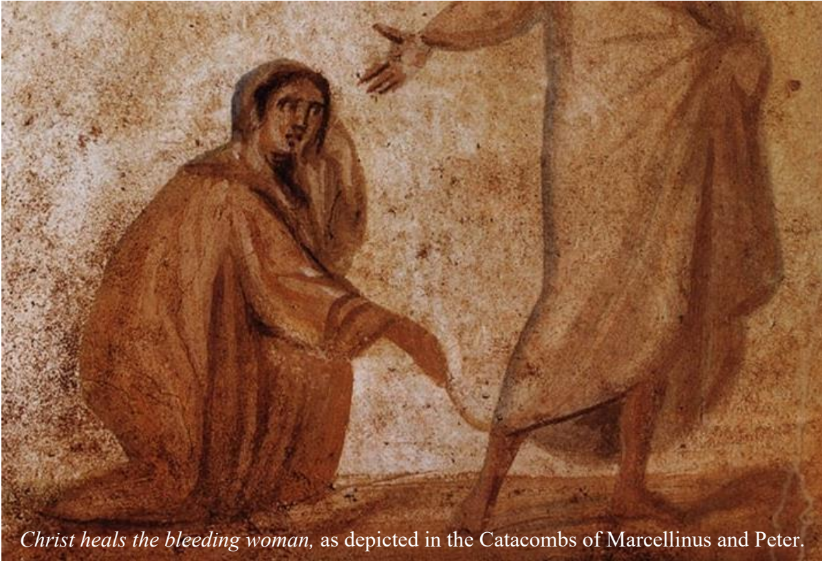
Christ heals the bleeding woman, as depicted in the Catacombs of Marcellinus and Peter.