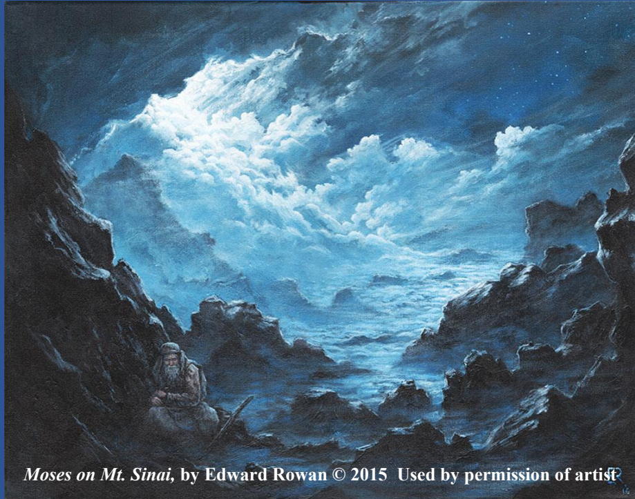
Moses on Mt. Sinai, by Edward Rowan © 2015 Used by permission of artist